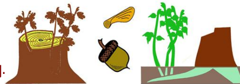
Adapted University of Minnesota, "Woodland Stewardship"

Seeds, stump sprouts, and root suckers are the most common ways that trees reproduce. However, in some cases, planting is necessary which results in about 13 million trees planted each year for reforestation or afforestation.