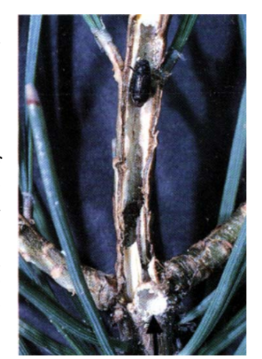
Figure 2. Mined shoots of Scotch Pine. (Arrow indicates entrance gallery)

Tomicus piniperda completes one generation per year throughout its native range of Europe and Asia. Overwintering adults initiate flight on the first warm (50-54^0 \text{ F}) days of spring which probably occurs in February or March in the Lake States in the northeastern United States. Adults quickly colonize either recently cut pine stumps, logs, or, at times, infest the trunks severely weakened trees. If necessary, adults can fly ½ mile (1 km) or