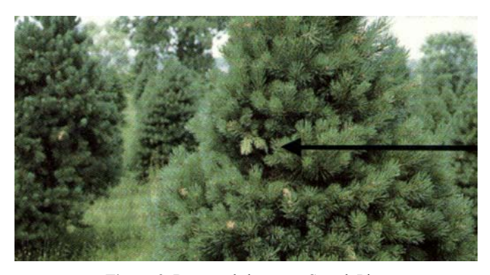
Figure 3. Damaged shoots on Scotch Pine

Generally, the reproduction phase of this beetle in pine stumps and slash causes little economic damage. However, in China and Poland, T. piniperda has attacked and killed apparently healthy pine trees.