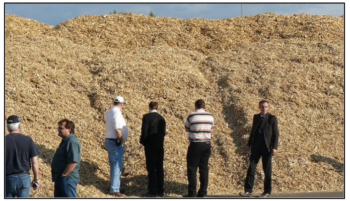
Shredded wood used to supply a small district heating plant.

The heating plant can be configured to use woody biomass as a feedstock (chips, shreddings, pellets, etc.). Various configurations can utilize different combinations of renewable feedstocks, as well as traditional fossil fuels.