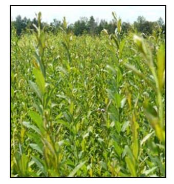
Willow genetics trial at the MSU Upper Peninsula Tree Improvement Center.

In the past, District Energy was used to help maintain snow-free and ice-free conditions on sidewalks and public areas, as well as for building heat. In the near future, District Energy may be an economical option to provide renewable, sustainable, and clean heat (and cooling) for business, government, and residential buildings. In some countries, a large and increasing portion of heating energy already comes from woody biomass.