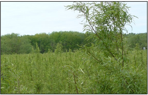
Willow energy plantation.

Extensive knowledge about forest soils and nutrient cycles will help support the sustainable use of wood in a bioeconomy. Michigan, Minnesota, and Wisconsin have each published biomass harvesting guidelines applicable to forest resources. A recent study on the Superior National Forest suggests that northern forests should be able to sustain increased biomass removal, but the economics of harvest may be an issue.