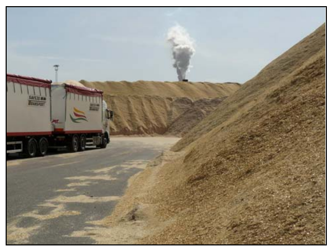
Wood feedstock for a large pellet plant.

assistance were made available. Hybrid poplar and willow show the most promise. Though plantations require energy inputs, research and practice in Swedish willow plantations show that outputs exceed inputs, and willow provides a significant portion of Sweden's domestic energy raw material.