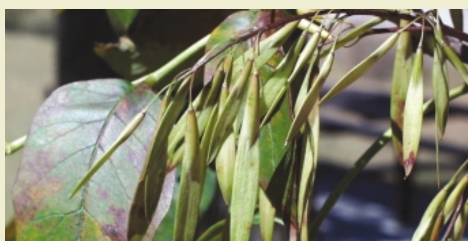
White ash seeds