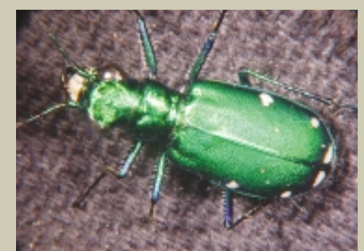
Six-spotted Tiger Beetle

If seen, call the Michigan Department of Agriculture EAB hotline: 1-866-325-0023 www.emeraldashborer.info