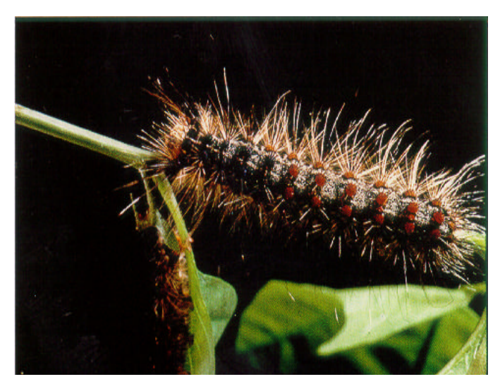
Gypsy moth caterpillars can feed on 300 different trees and shrubs.

Most gypsy moth outbreaks, typically last two to four years in urban areas, then collapse, usually because the caterpillars die from viral and fungal diseases. Parasites, predators, starvation