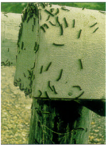
Large gypsy moth caterpillars can be annoying during outbreaks.

A gypsy moth egg mass typically contains 250 to more than 1,000 These eggs. egg masses can destroyed by scraping them into a can or bucket of soapy water. Hiding bands or sticky bands can be used on shade trees in your yard to help reduce the number of caterpillars feeding on the foliage of the trees. These methods are most effective when gypsy moth populations are at low or moderate levels and when only a require few trees