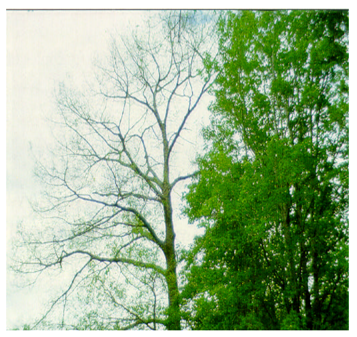
Oak trees (left) can be severely defoliated by gypsy moth caterpillars. Red maple trees (right) are rarely defoliated by gypsy moth.

or the Extension Toxicology Network<sup>2</sup> at: http://ace.orst.edu/cgi-bin/mfs/01/pips/bacillus.htm