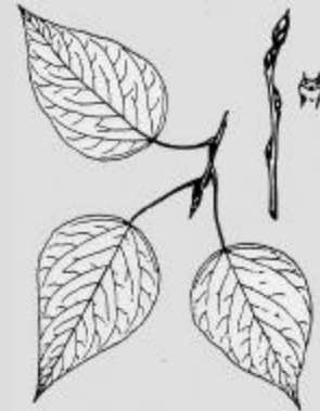
BALSAM POPLAR ( Populus balsamifera ). Balm-of-Gilead, tacamahac, bam, are other common names of balsam-poplar. Leaf is 3 to 6 inches long. Buds are brown and very resinous and fragrant.