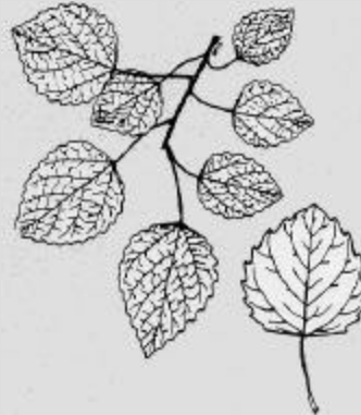
BIG-TOOTH ASPEN ( Populus grandidentata ). Similar to trembling aspen, except leaf has large, coarse margin. Leaf stem, also flat which causes quaking in a breeze. Tree bark is more yellowish in color than trembling aspen. Best of the aspens for lumber and pulpwood.