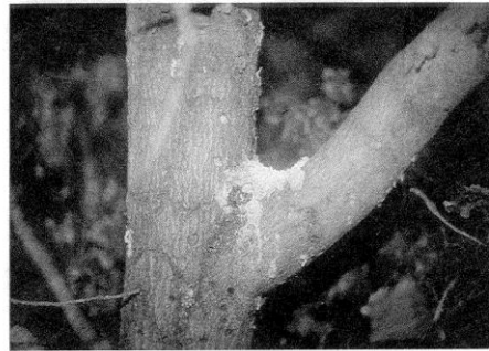
Figure 3. Sawdust from beetles chewing their way out of a tree.