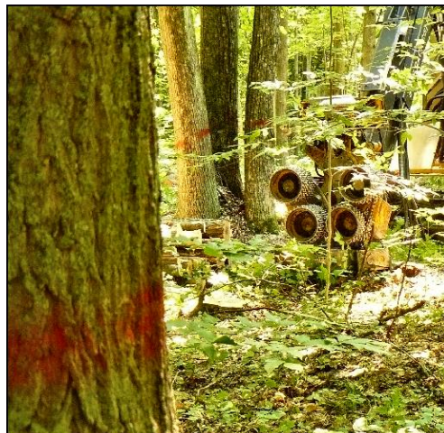
Northern Hardwood Harvest Operation

Selection system silviculture was developed for particular forest types and ecological conditions, such as better quality northern hardwood stands. It is not universally applicable to all forests. Different silvicultural systems have been developed for different forest types, based on forest ecology. Beware of timber buyers who talk about a "select cut" with little more than feel-good explanations. The use of the term "select cut" has been used for diameter-limit cutting and high-grading, both of which are among the worst forest practices in Michigan.