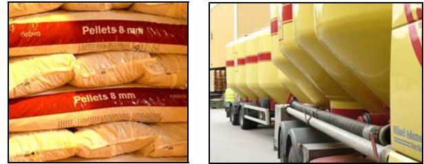
Bagged pellets for the home market and bulk pellets for commercial consumers.

Forest certification by third parties may limit access to certain energy markets, such as power plants that are regulated by state renewable portfolio standards (RPS). These are the laws that make utilities provide a specified percentage of their power from renewable sources by a certain year, such as 10 percent renewables by 2015. The regulations often define woody feedstocks as only those from certified forests. Most individual and family forest owners do not have their forests certified. Certified requirements effectively exclude