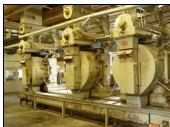
A pellet die that fits into a pelletizing press.

Finding pelletizing technology is not difficult. A number of market-ready, off-the-shelf systems can be considered. Pellets are formed under heat and high pressure by extruding fiber through a heavy die. No adhesives are required with adequate feedstock mixes. Feedstock must be dry before pellets are made.