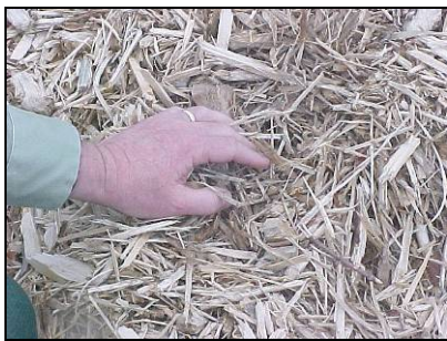
Shredded bark and wood.

Most of the soil nutrient and water cycles would be largely unaffected by biomass harvesting, except for some short-term disturbances. 1 Effects vary widely and are site-specific. Of course, certain soil types, such as infertile sands, would likely sustain certain loss, such as calcium, if harvesting occurred too frequently. Energy plantations would be higher risk on these soils, but plantations are unlikely to be established on these kinds of soils. Adhering to biomass harvesting guidelines would minimize or eliminate risks. The majority of our forest land should be able to support sustainable harvest levels of both timber products and biomass for energy.