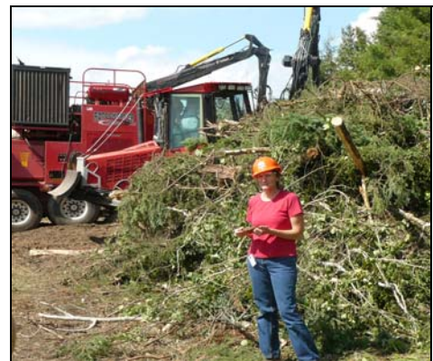
Slash to be processed at a log landing.

The largest pool of woody biomass comes from annual forest growth. Michigan forests have experienced some of the greatest net growth volume accumulations in the nation. 2 Our forests could contribute vast amounts of woody biomass in a sustainable manner. Even if we capture 25 percent of that annual growth, significant inroads will be made into reducing fossil fuel consumption and building a more sustainable energy economy.