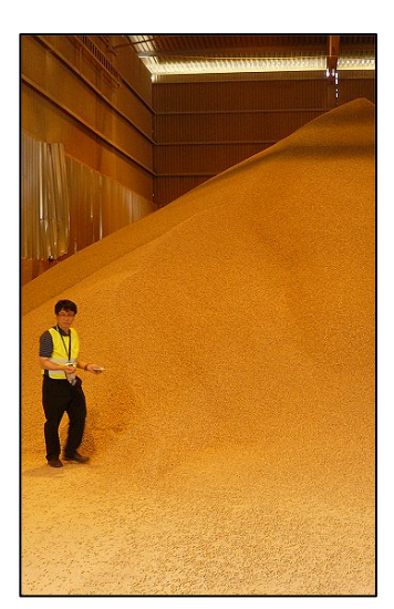
Pellet storage area.

employed to extract and distribute woodgenerated heat vary. Many home furnaces, both indoor and outdoor, are inefficient and cannot be used where air quality standards apply.