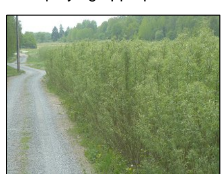
Willow energy plantation.

Employing appropriate wood-using technolo-