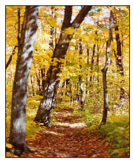
Northern hardwoods, Michigan's most abundant forest type.

Applying strategic planning to the bioeconomy on a statewide or regional scale will likely yield the best long-term alternatives. Pooling Industrial, governmental, and university resources has been a proven model to overcome environmental, social, and economic challenges in building a bioeconomy. Woody biomass, together with other renewable energy sources, will help reduce dependency on fossil fuels and improve our lagging rural economy.