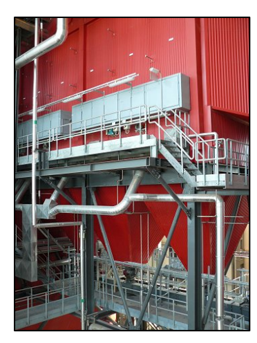
Large CHP plant boiler.

distributed through a District Energy grid. Efficiencies are high, and small to large cities can be served by CHP plants. St. Paul, Minn., has a CHP plant that largely runs on municipal solid waste. Both district heating and CHP plants can also produce pellets for local housing that is outside of the hot water grid or for sale to larger markets.